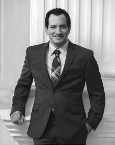
Anthony Rendon Speaker of the Assembly